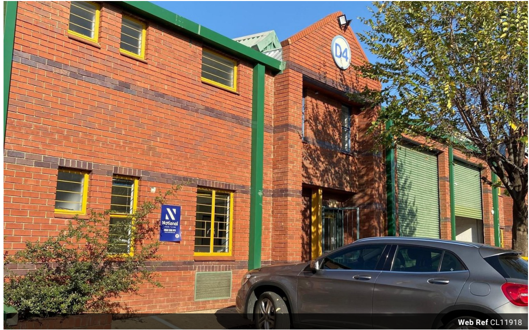
Web Ref CL11918

9 Davallen Avenue Glenashley Durban North 4051