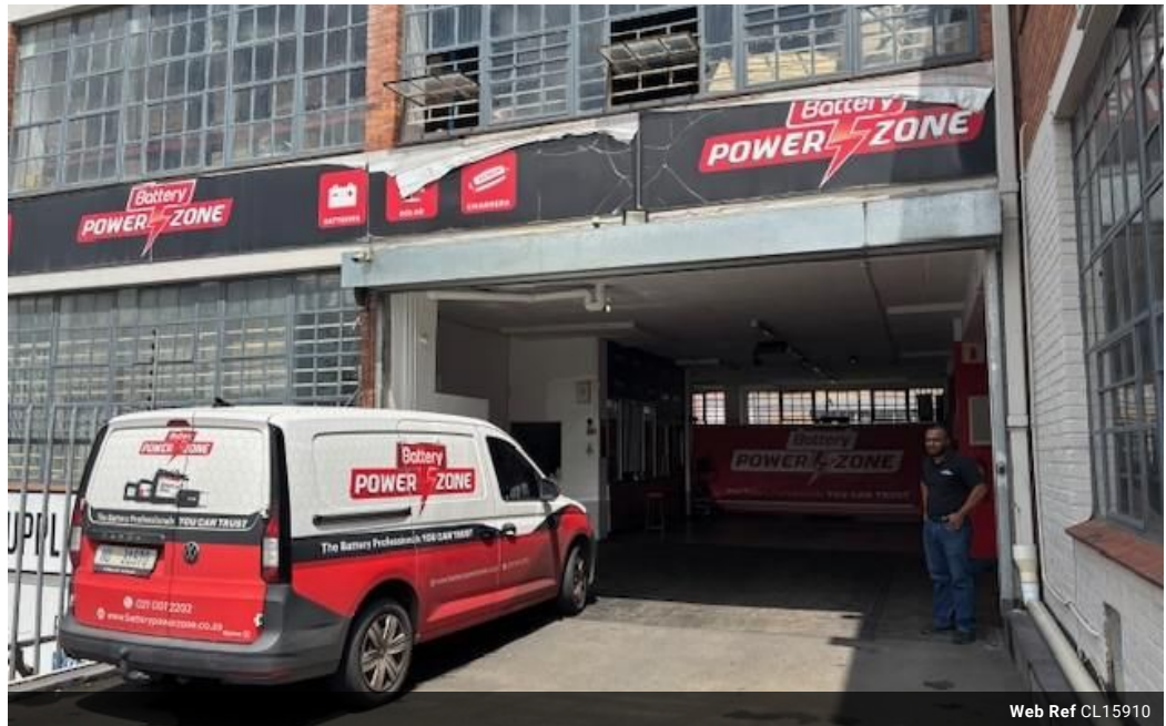
Web Ref CL15910

9 Davallen Avenue Glenashley Durban North 4051