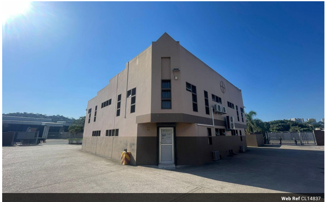
Web Ref CL14837

9 Davallen Avenue Glenashley Durban North 4051