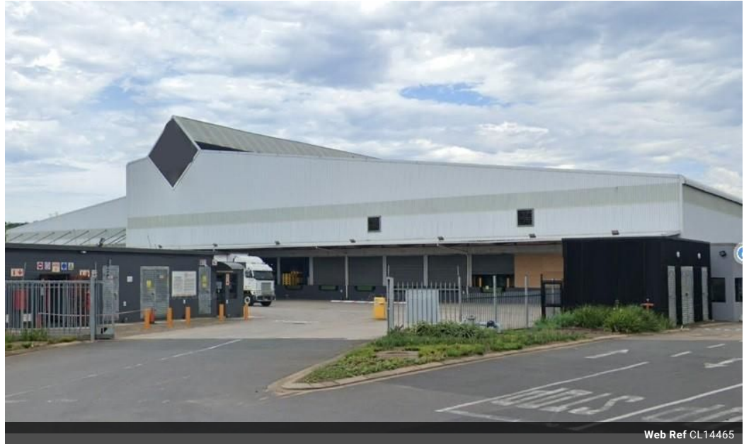
Web Ref CL14465

9 Davallen Avenue Glenashley Durban North 4051