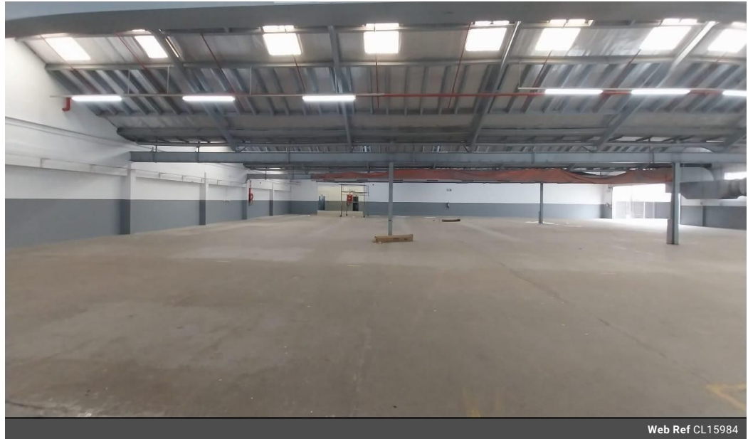
Web Ref CL15984

9 Davallen Avenue Glenashley Durban North 4051