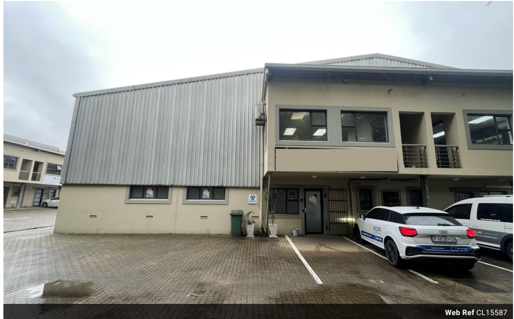
Web Ref CL15587

9 Davallen Avenue Glenashley Durban North 4051