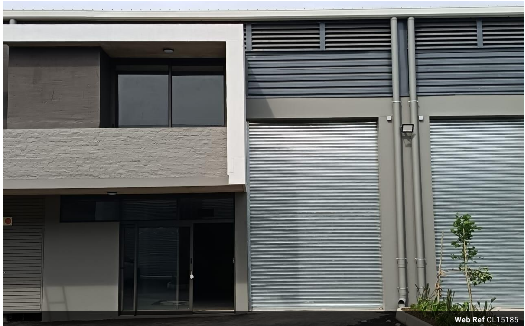
Web Ref CL15185

9 Davallen Avenue Glenashley Durban North 4051