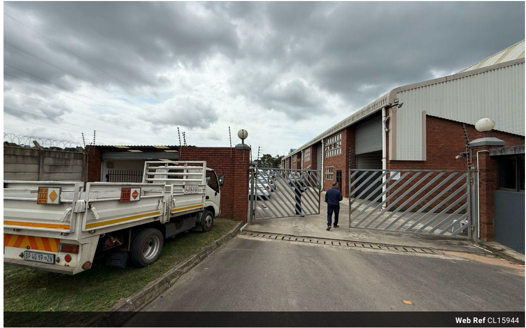
Web Ref CL15944

9 Davallen Avenue Glenashley Durban North 4051