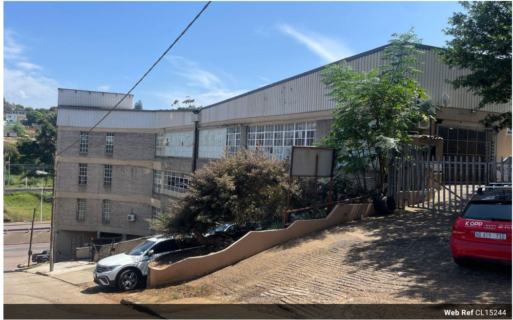
Web Ref CL15244

9 Davallen Avenue Glenashley Durban North 4051