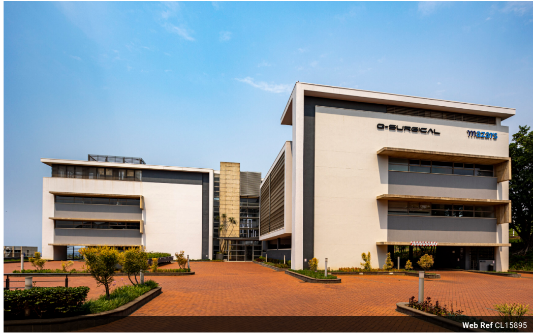
Web Ref CL15895

9 Davallen Avenue Glenashley Durban North 4051