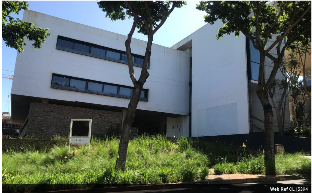
Web Ref CL15394

9 Davallen Avenue Glenashley Durban North 4051