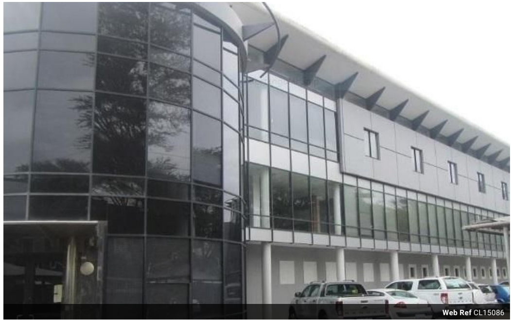
Web Ref CL15086

9 Davallen Avenue Glenashley Durban North 4051