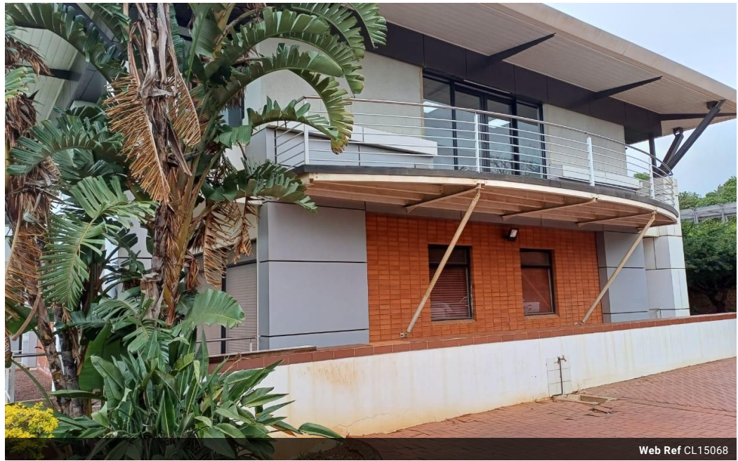
Web Ref CL15068

9 Davallen Avenue Glenashley Durban North 4051