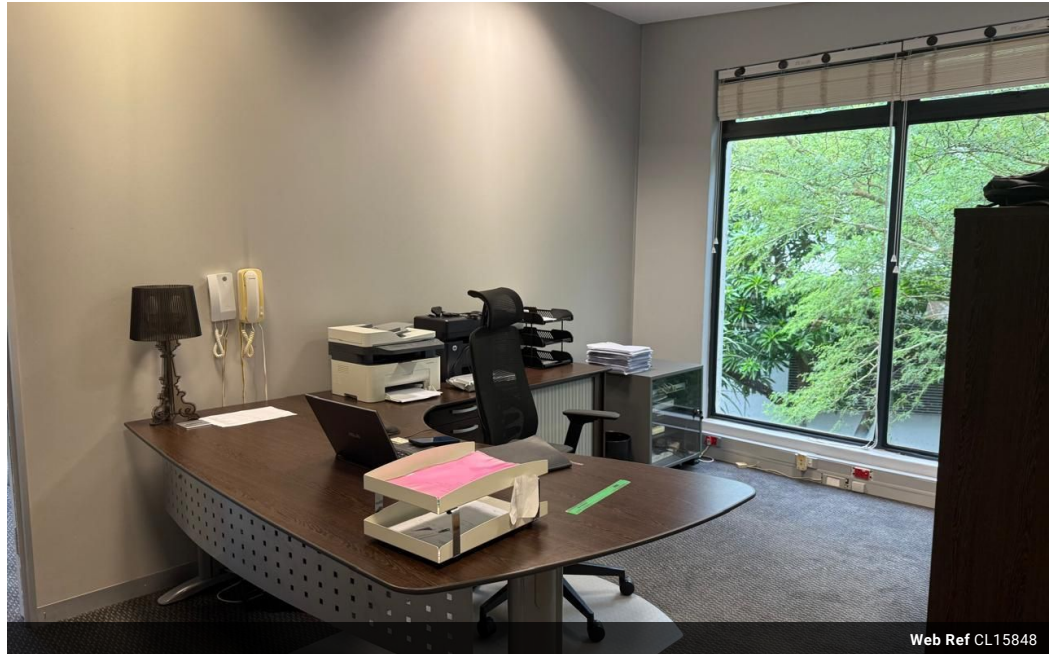
Web Ref CL15848

9 Davallen Avenue Glenashley Durban North 4051