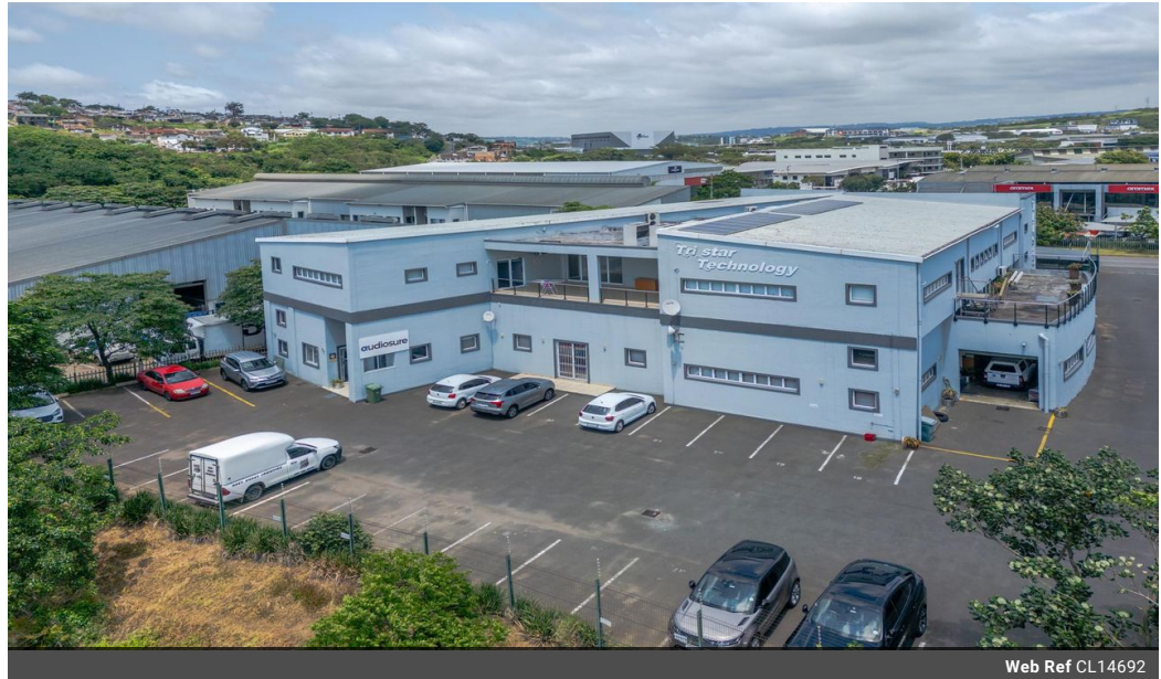
Web Ref CL14692

9 Davallen Avenue Glenashley Durban North 4051