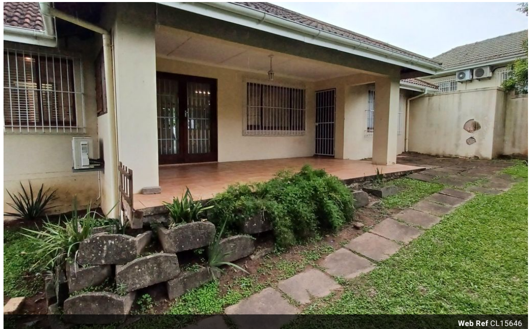
Web Ref CL15646

9 Davallen Avenue Glenashley Durban North 4051