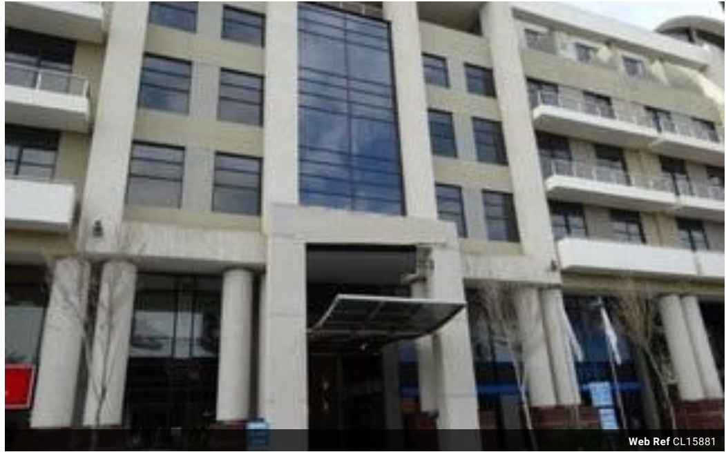
Web Ref CL15881

9 Davallen Avenue Glenashley Durban North 4051