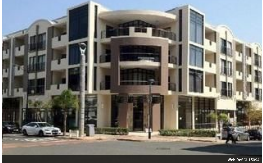
Web Ref CL15094

9 Davallen Avenue Glenashley Durban North 4051