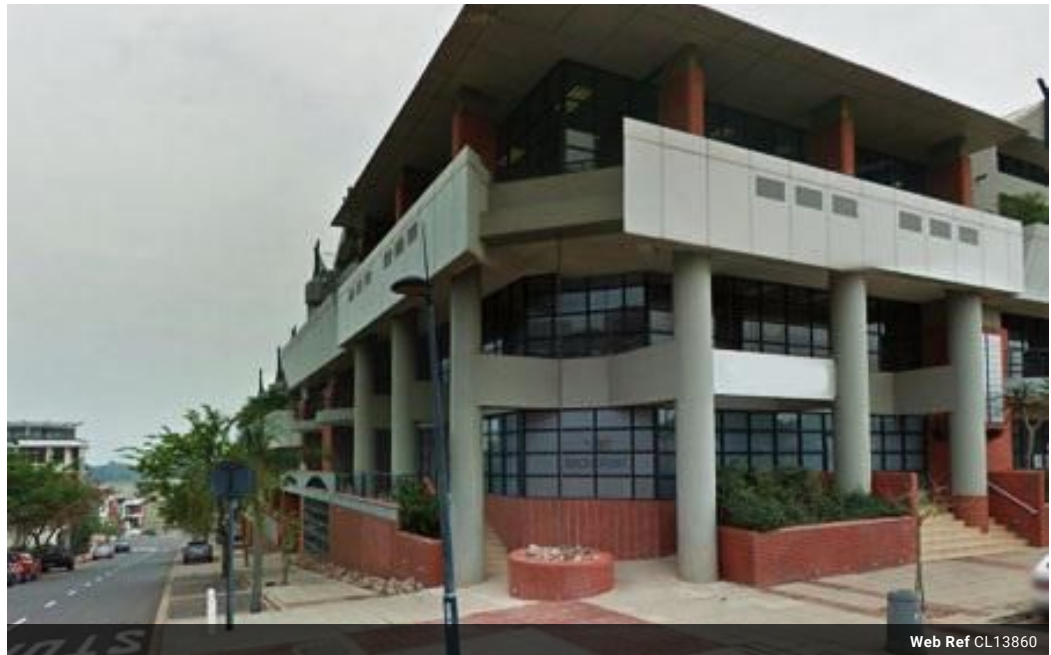
Web Ref CL13860

9 Davallen Avenue Glenashley Durban North 4051