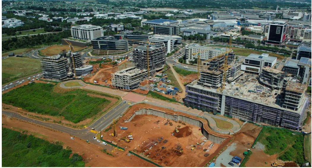
Web Ref CL11664

9 Davallen Avenue Glenashley Durban North 4051