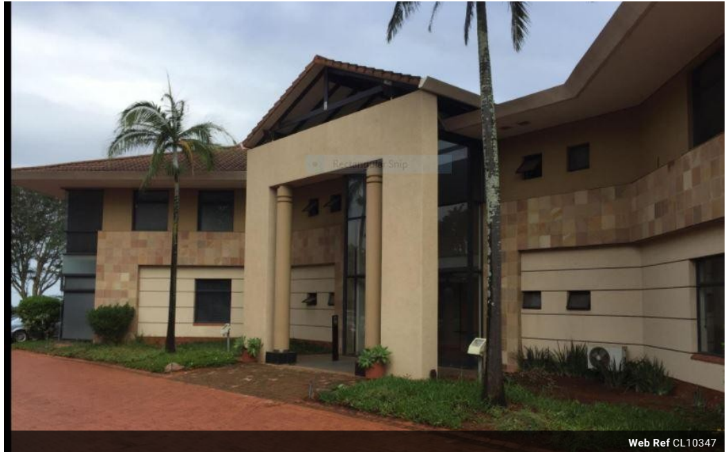
Web Ref CL10347

9 Davallen Avenue Glenashley Durban North 4051