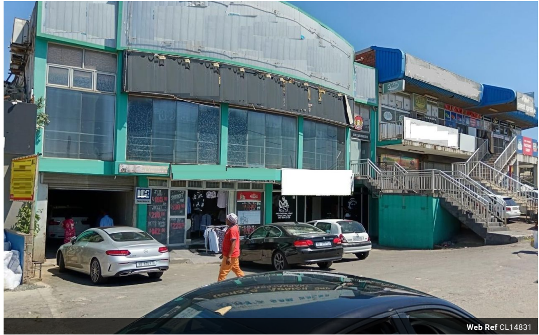
Web Ref CL14831

9 Davallen Avenue Glenashley Durban North 4051