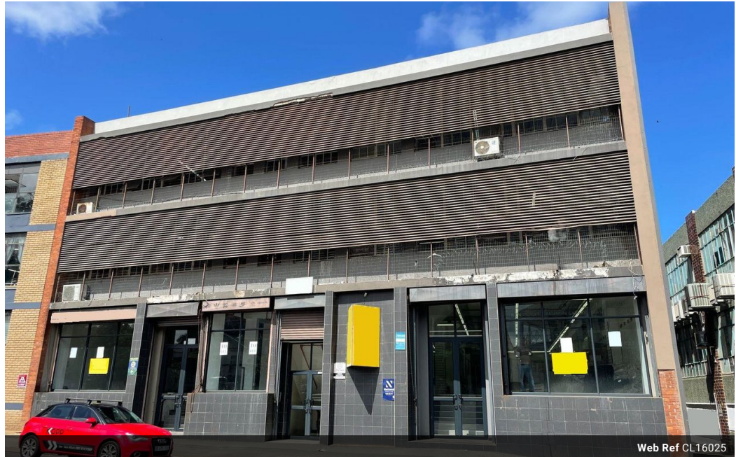
Web Ref CL16025

9 Davallen Avenue Glenashley Durban North 4051