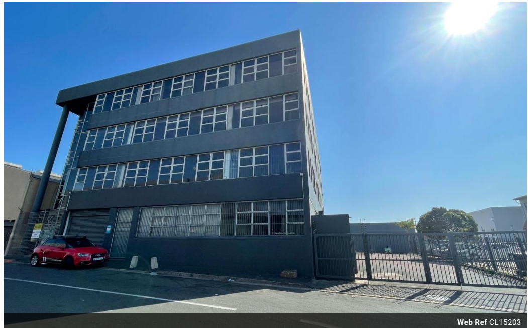
Web Ref CL15203

9 Davallen Avenue Glenashley Durban North 4051