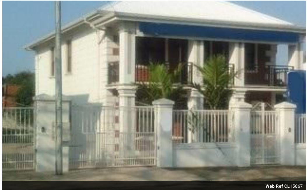
Web Ref CL15867

9 Davallen Avenue Glenashley Durban North 4051