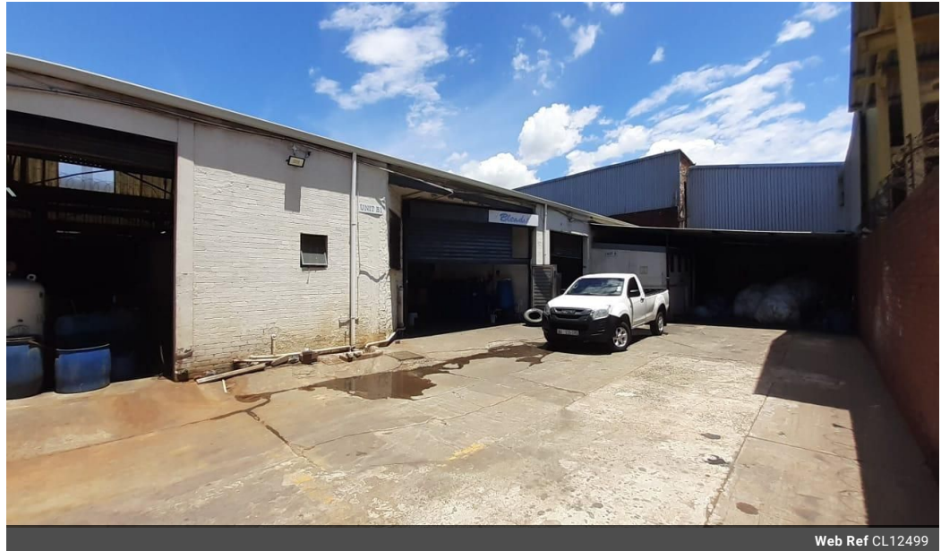
Web Ref CL12499

9 Davallen Avenue Glenashley Durban North 4051