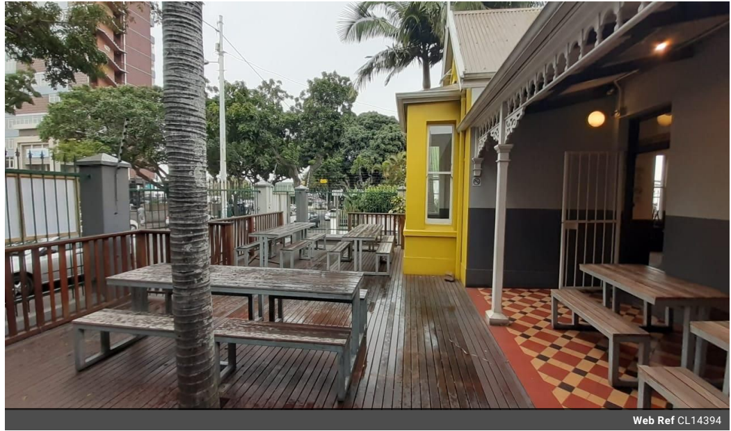
Web Ref CL14394

9 Davallen Avenue Glenashley Durban North 4051